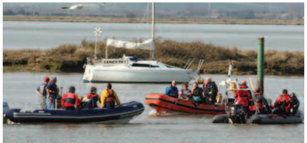
What do you call a group of instructors in RIBs?

"We think we can incorporate it into instructor and coaches courses. It'll be a major result if we can. We have tutors who will deliver the three-hour SportsCoach UK awareness course to clubs, through OnBoard, Team 15 and