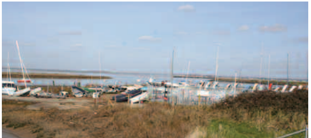
The weather could not have been better. Bradwell Creek