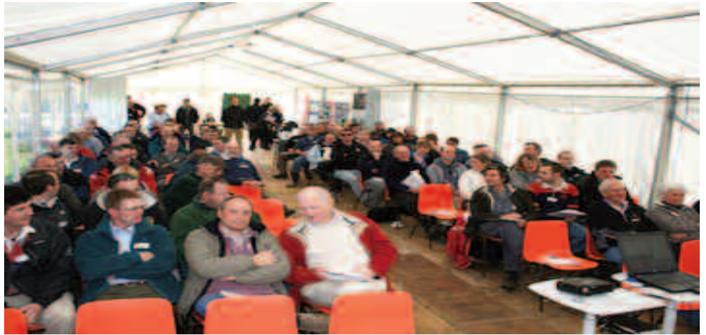
An expectant audience

Child protection continued to raise concerns. "We're not at risk really, in fact on the water we're very good. The latest move by government is to make all sports instructors in the country go through a three-hour child protection course every three years and be licensed.